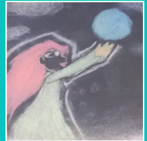
Got the whole world...