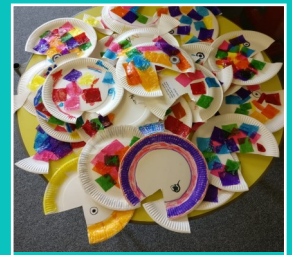
Better to give...